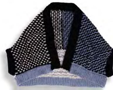
Version 2 - Front