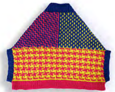
Version 1 - Back