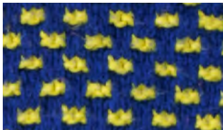
PANEL 1: (Right Front)